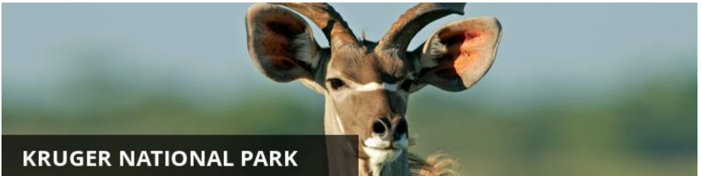
KRUGER NATIONAL PARK